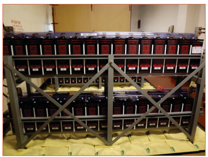
One of the battery racks at RH Saunders

VCC custom-designed the LED lamp for OPG considering all of the challenges and drawing on their years of experience in solid state indication and lighting for demanding applications. The LED driver had to accommodate the wide range of AC and DC voltages demanded and desired of this lamp. These electronics also incorporate the temperature sensing and fold-back circuitry to protect the LED from over-temperature conditions that are exacerbated by the enclosed fixture. VCC had extensive testing performed by a third-party authority and the design was revised and finally passed all requirements of UL 1993 (Self-Ballasted Lamps) for fully-enclosed fixtures.