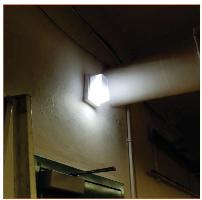
Emergency-Powered LED Lighting In-Action