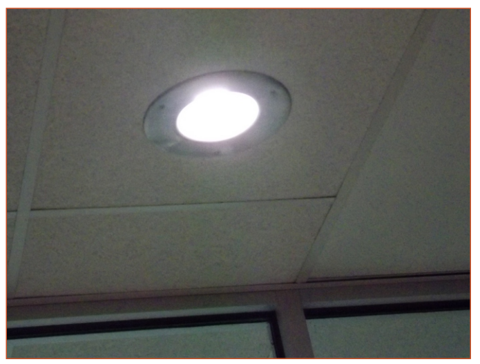
Typical Facility Fixture

LEDs are semiconductors, and their life is depleted by elevated temperatures. The junction temperature of these devices should be kept below 125 degrees Celsius.