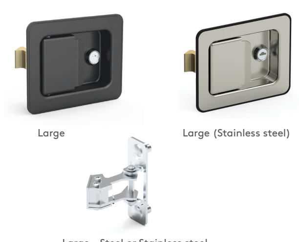
Large - Steel or Stainless steel