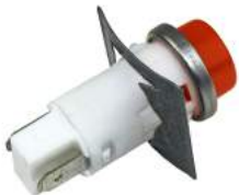
Speed nut accessory

Featuring a bezel finish and polished stainless steel, the 1092 Series is compliant with RoHS and REACH requirements.