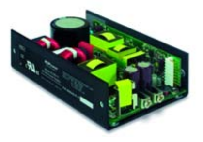
Figure 2: The increased use of digital control loops enhances performance and enables the supply to adapt to varying and complex line and load situations

Increasing the frequency of operation represents a trade-off in size versus efficiency. This is due to increased core losses in magnetics and increased switching losses in the semiconductors. In the AC input range from 90VAC to 264VAC, we have 380-400VDC at the output of PFC stage, but it is difficult to employ a 450VDC capacitor because of size. In this universal range right now, it is not advisable to go to higher internal voltages. But if 48VDC becomes the standard voltage for the output, very high efficiencies could result.