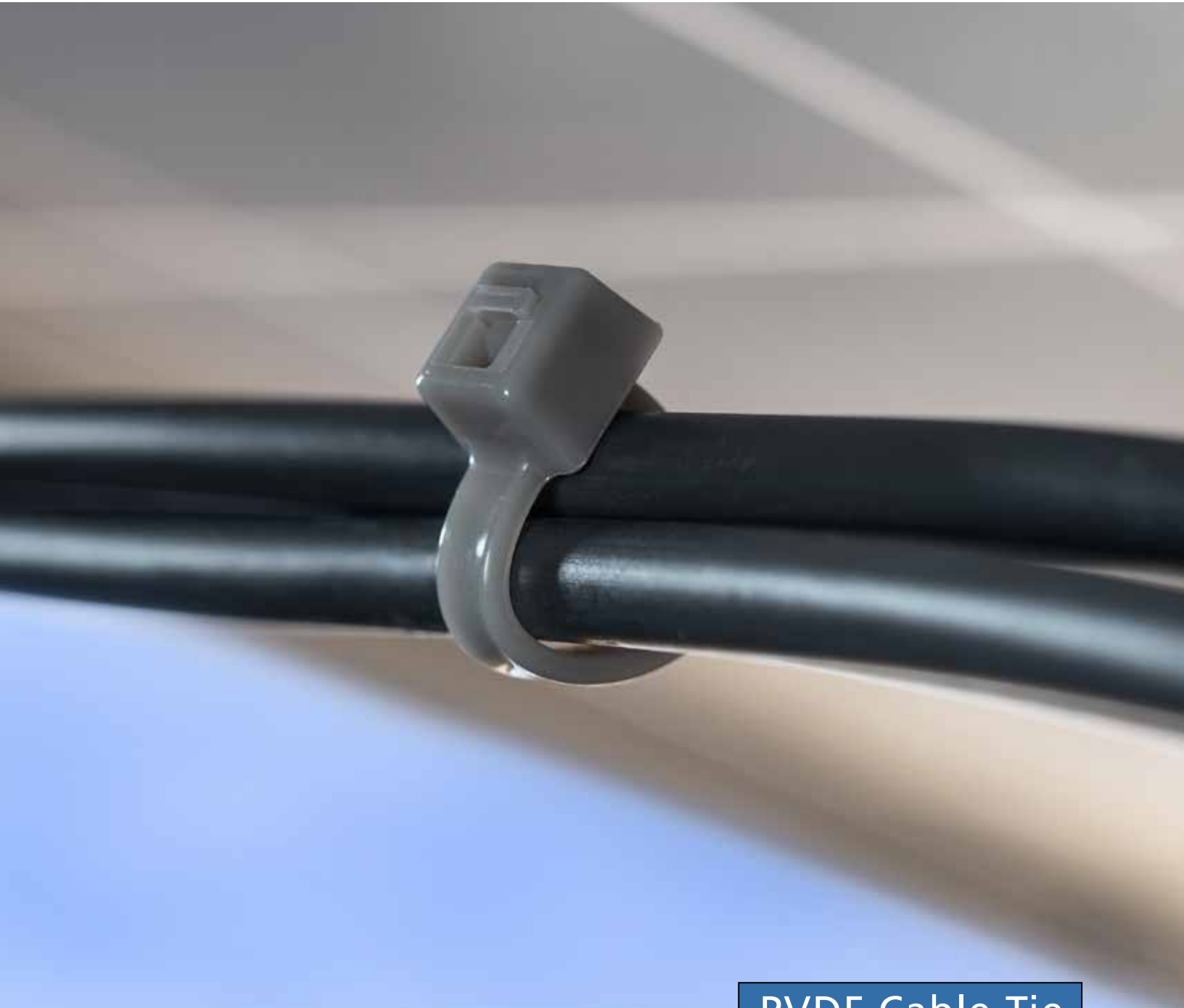
PVDF Cable Tie