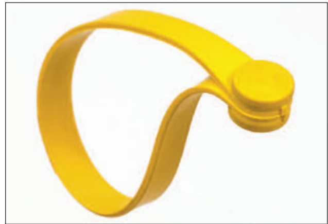
Cable Koala Tie.