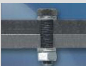
Hexagon bolt in a through-hole, secured on both sides