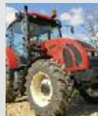
Agriculture and forestry