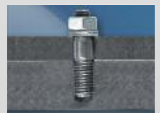
Secured stud bolt