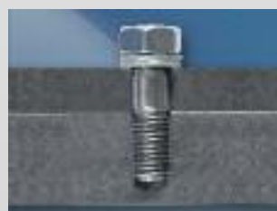
Hexagon bolt secured in a blind hole