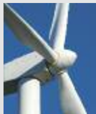
Wind energy technology