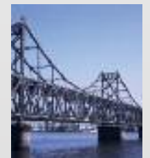
and many more