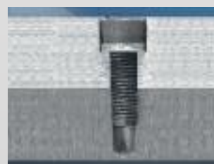
Countersunk secured cylinder bolt