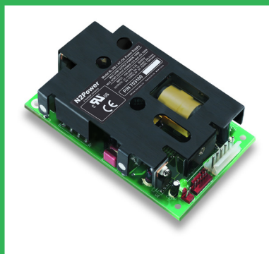
Figure 2: a) The XL125 125W AC/DC supply and b) the XL160 160W supply from N2Power differ primarily in their power rating; their footprint, physical size, connector, and many other specifications are otherwise identical